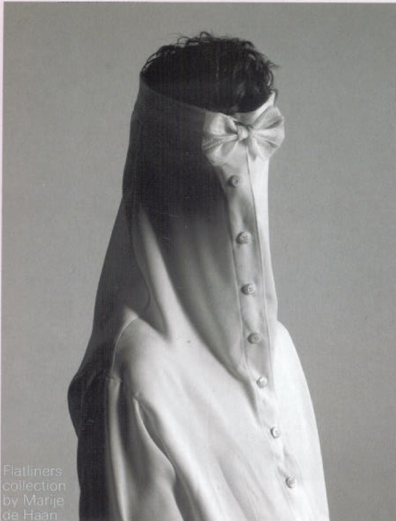
Flatliners collection by Marije de Haan

Marije de Haan's 'Flat Liners' menswear collection continued with a focus on anonymity. Crime-scene investigative photography with a humoristic edge à la Magritte paves the way to a headless persona in the tradition of 'c'est ne pas une tête' - dressed in dandy-like blankets, blouses and sweaters.